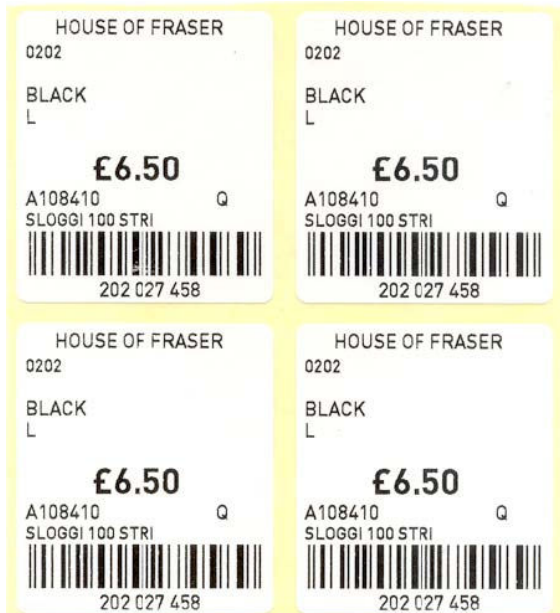
(Image is for reference only. It is of low resolution, and not accurate for colour or size.)